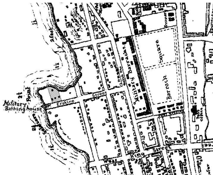
Sydney Town near Erskine Street in 1836, (Between Military Barracks and Military Bathing Area)