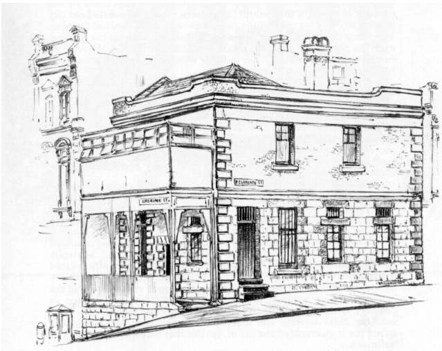
Old Watch House, corner of Erskine Street and Clarence Streets. Built in 1827. Up the hill from the Brown’s address. 370 Still standing.