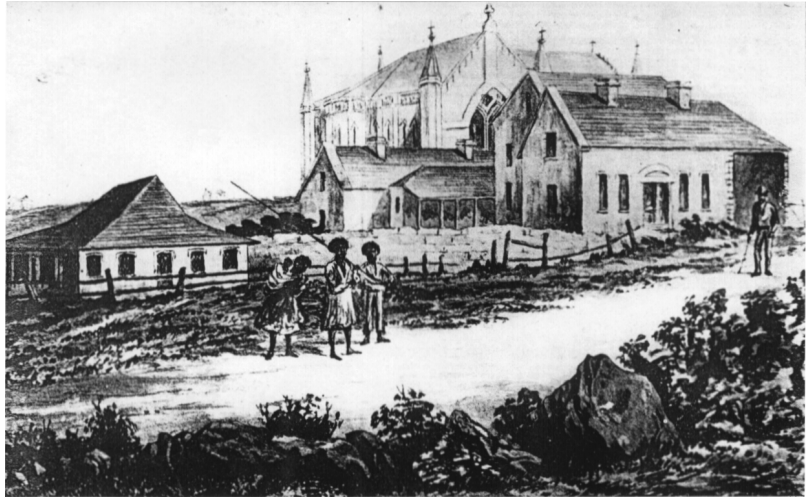
St Mary's Chapel in the background of this Sydney street scene of 1836 404