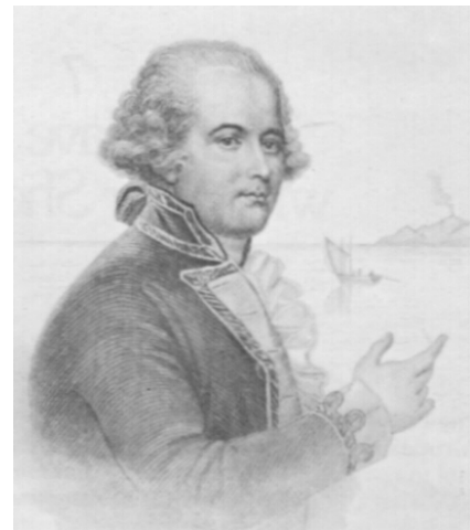
Captain William Bligh (1754 – 1817) Governor of NSW. 6 Aug 1806 to 26 Jan 1808