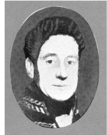
Colonel Lachlan Macquarie (1761 – 1824) Governor NSW 1 January 1810 to 1 December 1821.

The Hawkesbury was the colony's 'bread-basket', and so Macquarie was at pains to assure them of his intention to assist them. He personally investigated their circumstances, and set in train measures to aid the development of the Hawkesbury area including the creation of the five towns.